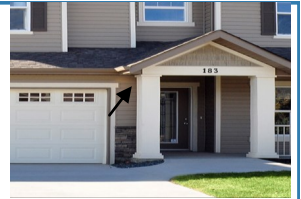
No Step Entry

VisitAbility defines a minimum level of accessible housing so these features are required starting points for the next section of this guide