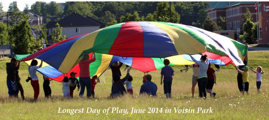
Longest Day of Play, June 2014 in Voisin Park

Planning ahead smooths the way, turns tasks into accomplishments, so everyone has fun! Even You.