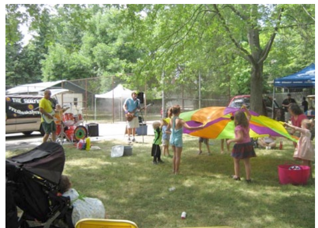
Warm sunshine, partial shade, music, face painting, fire fighters, games, pop corn and cotton candy brought the neighbours together in Lippert Park on July 14th.

Kitchener's ten councillors are once again vying for the bragging rights for having the most number of neighbourhoods with registered activities. All members of city council have been challenged to promote the Festival of Neighbourhoods and encourage neighbours to meet each other face to face in their neighbourhood with any kind of activity or get-together. Be sure to register your neighbourhood activity before October 5th, and help your ward win this challenge!