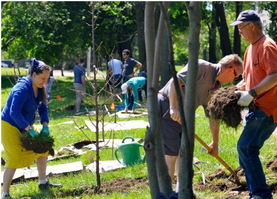
Neighbours of Weber Park gathered to plant an edible forest on June 6. Mansion Greens Community Garden provides constant opportunities for neighbours to meet each other.