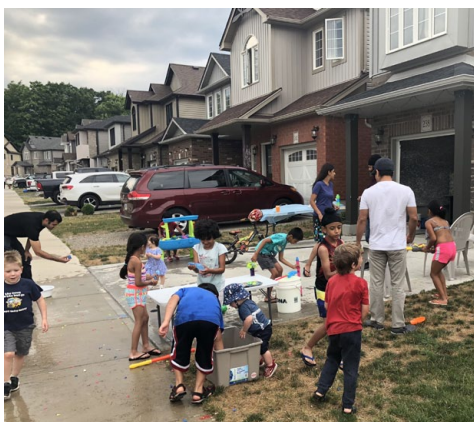
Moorland Water Balloon Event July 20, '18