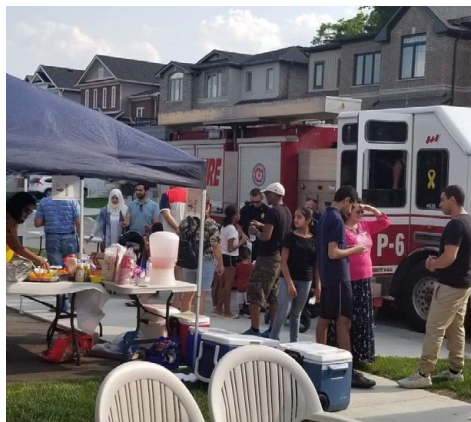
Moorlands Cres. Meet & Greet. Spring, '18