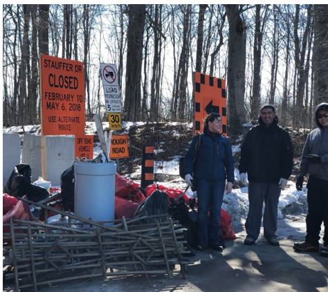
Doon South Clean-up. March 18, '18