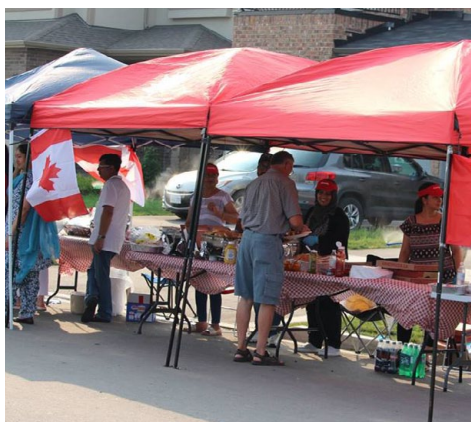
New Doon BBQ June 30, '18